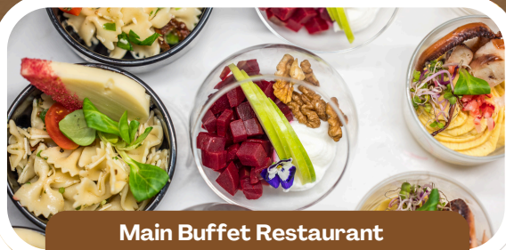
Main Buffet Restaurant “Natura”