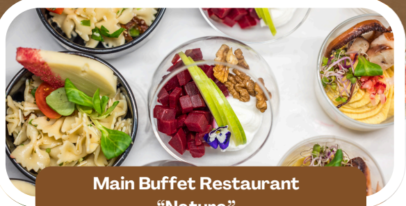
Main Buffet Restaurant “Natura”