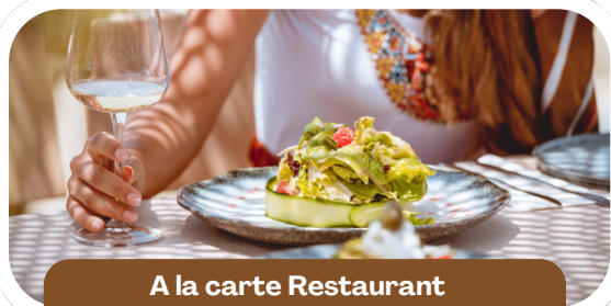
A la carte Restaurant “Lemoni”

* dinner may be swapped to lunch upon request in advance or during guests' stay.