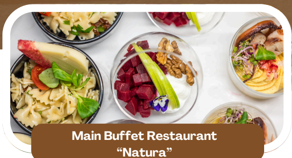
Main Buffet Restaurant “Natura”